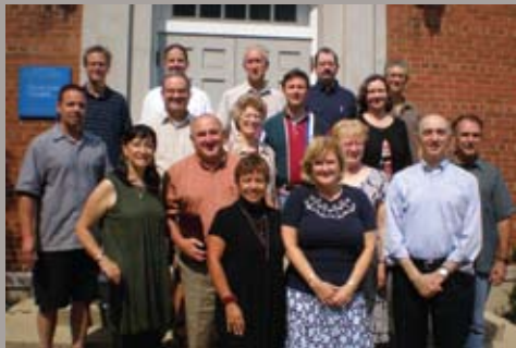
Above: Center for Spiritual Direction Graduates, Summer 2008

“At the advice of mentors, I sought out a spiritual director, and through this unique ministry I began to regain the intimacy of my relationship with Christ and the fire of my calling was re-ignited. ... Because of spiritual directions’ profound effect on my walk with Christ, I wanted to expose my congregation to this unique ministry experience. I was accepted in the Center for Spiritual Direction ... and for the past three years have watched my church’s and my relationship with Christ grow even deeper.”