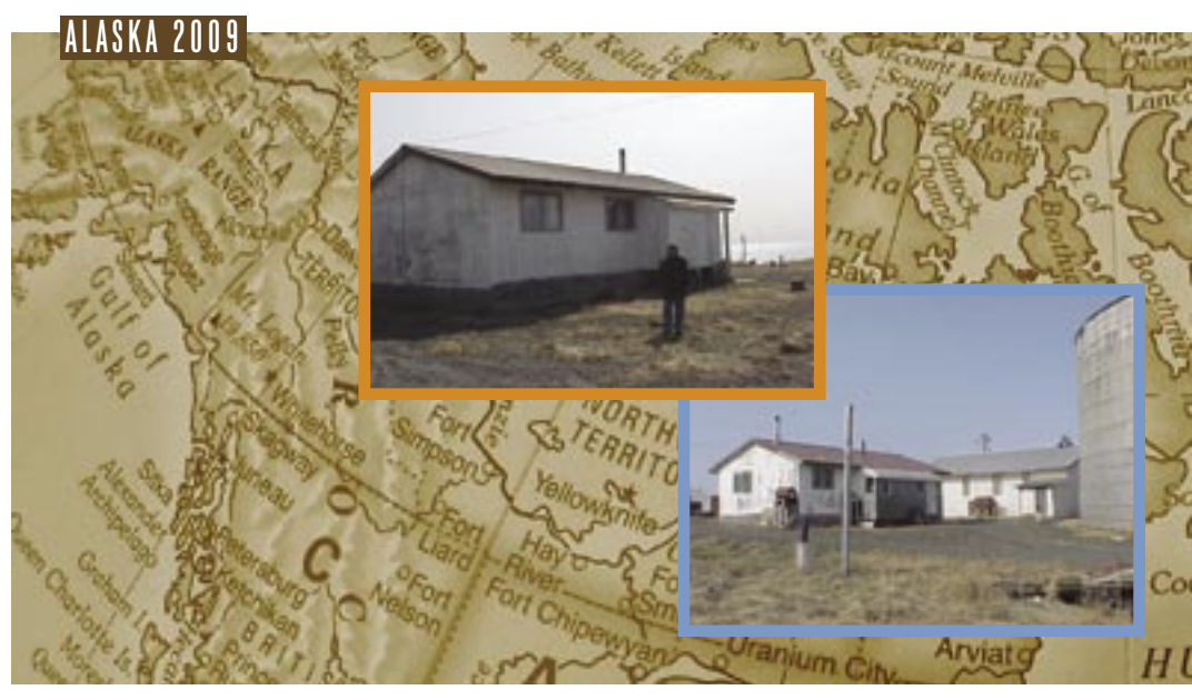
The parsonage and church in Shaktoolik, Alaska, are examples of buildings that will benefit from NWC sponsorship.

he first mission field that our denomination began working in was Alaska. We are thankful for the ministry there that continues to this day.