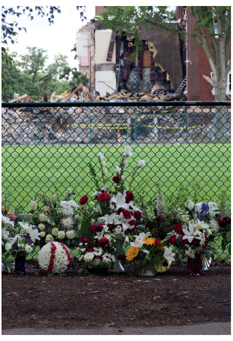
FALL 2017 MINNEHAHA MAGAZINE

Students made memorials near the explosion site. Posters, flowers, and