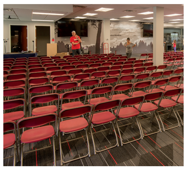
Thank you Mortenson Construction, the architectural firm ATS&R, and all the sub-contractors who did an enormous amount of work to get Minnehaha Academy students back to class on September 5!